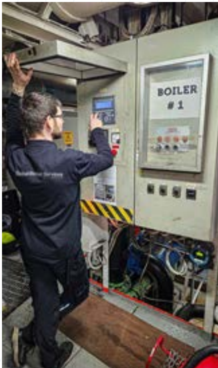
Unisab retro fit

Upgrade your system today and experience smoother operations with less downtime and lower costs.